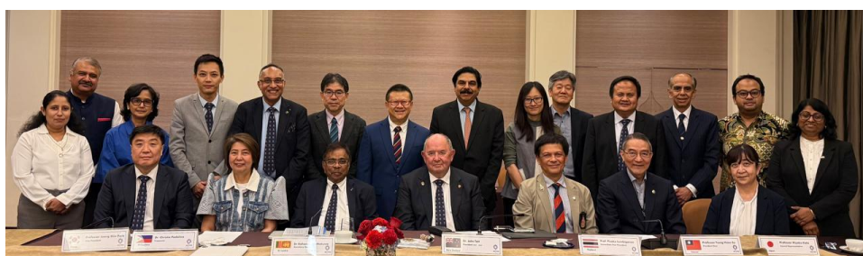
Action Plan Meeting