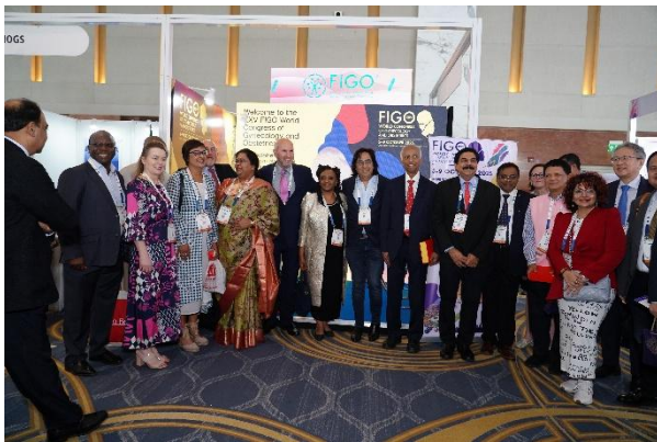
AICIG 2025 at the FIGO stall

I wish to conclude by requesting our member societies to keep us informed about activities which AOFOG could join. I also look forward to closer collaboration with the National Societies in 2025.