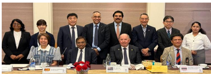
Exec Board meeting

I would like to highlight the recent AOFOG Executive Board Meeting and Action Plan Meeting (APM), held on February 8th, 2025, at the Hotel Anantara Siam in Bangkok, Thailand. It was encouraging to see 100% attendance at both meetings, which were very successful and productive. The committee chairs presented their completed work and future plans at the APM.