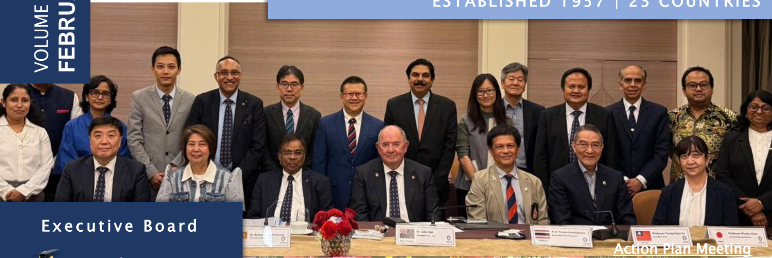
Action Plan Meeting