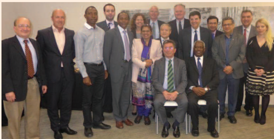
The Expert Group in London (May 2014)

FIGO's new initiative to produce, disseminate and implement evidence-based standards of care protocols on caring for women with gestational diabetes (with financial support secured from Novo Nordisk) began in earnest at a meeting of independent experts held in London in May.