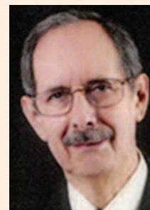
Professor Anibal Faúndes

It is free to access online at www.ijgo.org/issue/S0020-7292(14)X0006-8 .