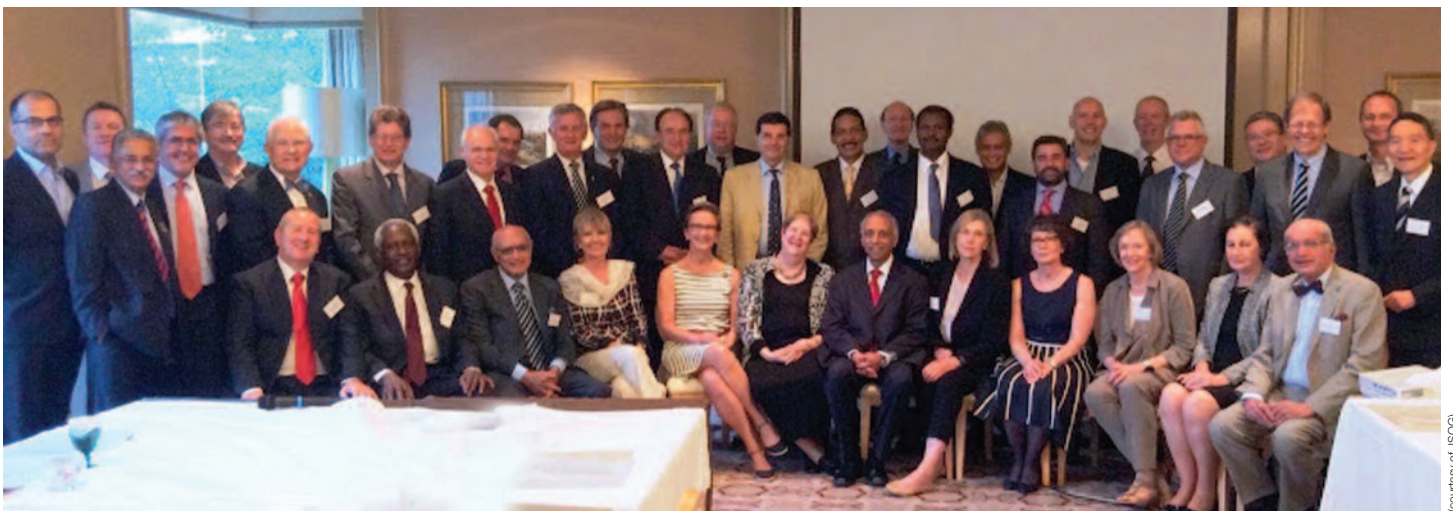
Executive Board Meeting, July 2014, Tokyo