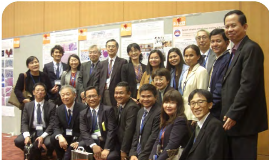
(写真) 福岡での第56回日本臨床細胞学会秋期大会にて