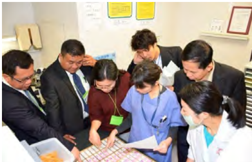
(写真) 順天堂大学医学部付属練馬病院にて