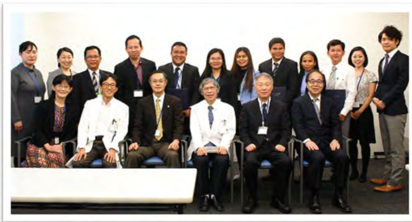
(写真) 大阪国際がんセンターでの 研修修了式

Last but not lease, I would like to say special thanks to Sensei, Professor, Doctor, coordinator, NCGM, and Japanese government help us for training about new technique for improving quality.